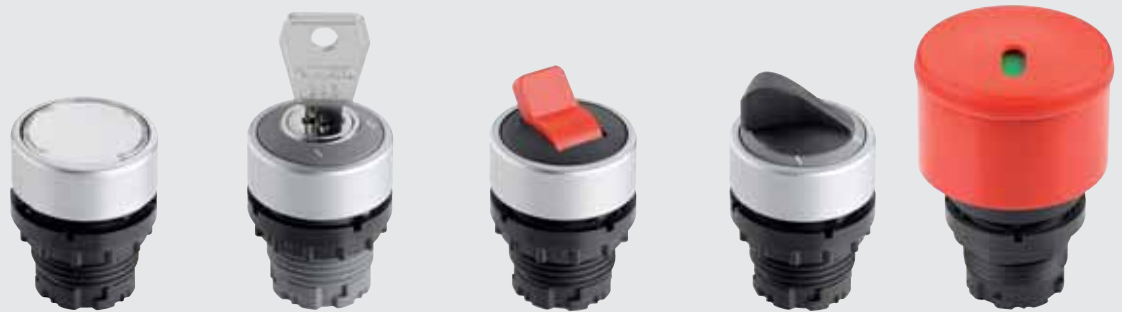
pushbuttons with marking option key switches with illuminating option toggle switches selector switches with illuminating option emergency stops

Control units of the DUX-Basic series are manually operated electrical components to fit a mounting diameter of 22.3 mm. They serve to switch auxiliary circuits and are used in the machine building industry, ship and rail vehicle building, in lifting gear and many other branches of electro-technology.