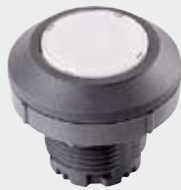
pushbuttons with illuminating and marking option