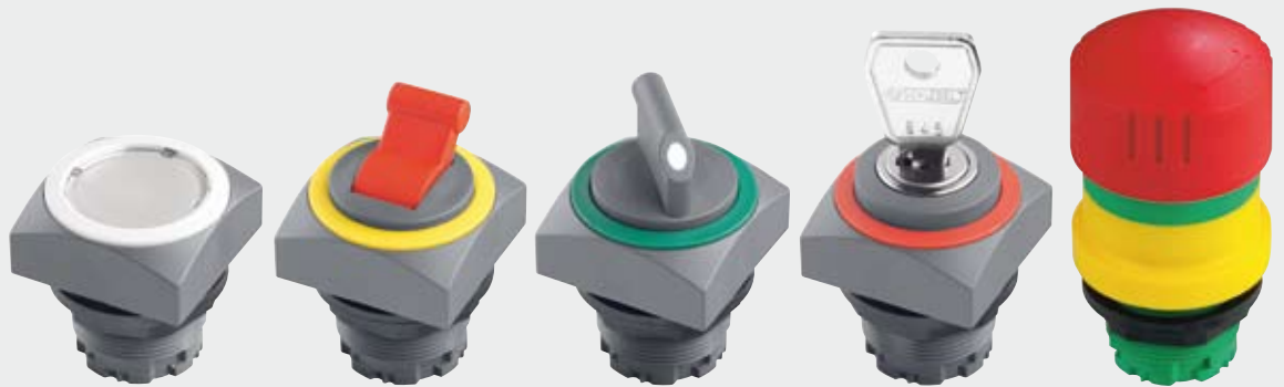
illuminated push- buttons with marking option

Degree of protection: IP65 Protection class : II