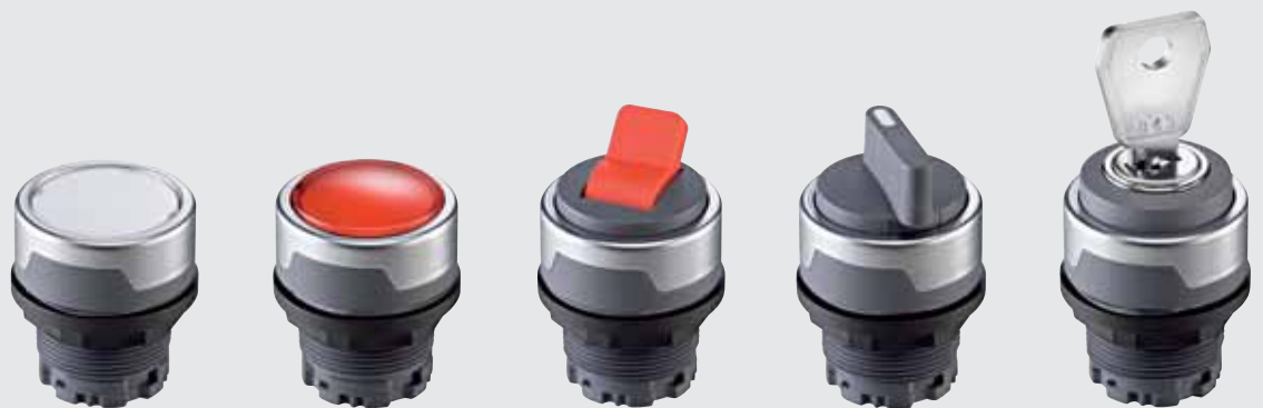
pushbuttons with illuminating and labelling option

Degree of protection: IP65 Protection class: II