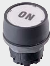
pushbuttons with illuminating and marking option

Degree of protection: IP65 Protection class : II