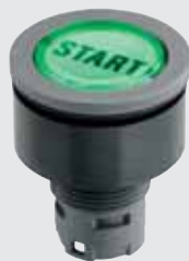
Illuminated pushbuttons with marking option